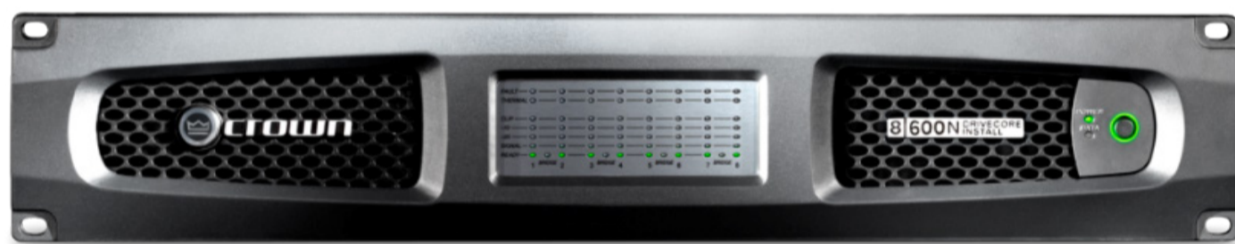
Crown DCi 81600N